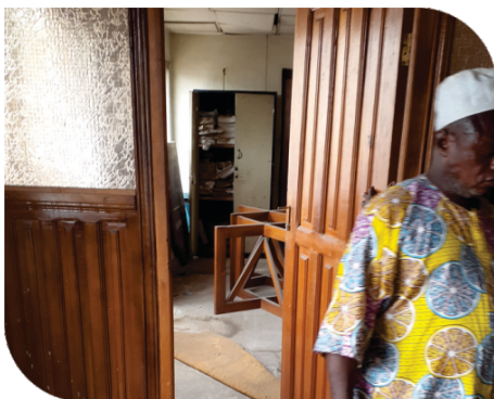
Entrance to future Sacristy

It seems well maintained and also has new windows. Being so high up, it is very secure, and iron gates protect it. The lowest hall, on the ground floor, will be used for catechism classes and parish meetings.