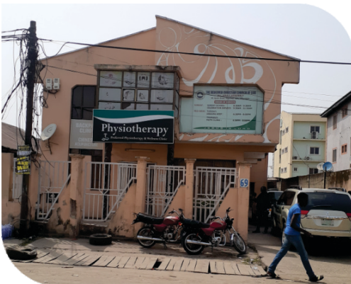
Front view of the building

The property is located on a typical English colonial one lot block, which is 60 feet by 120 feet in size, and the price N80 million, which sum was mostly borrowed and must be repaid. It is for this reason that we request your generosity.