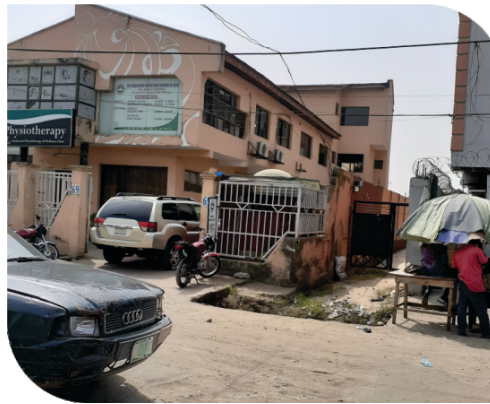
View from the street

The building consists of two sections, joined together by a central staircase to all sections of the property. The front building, well maintained, consists of two floors. The ground floor measures of 9 m x 18 m, with a hall at the front 9 m x 6 m, and then a hallway behind with three rooms off it on each side. There is a staircase going up to the upper section. It will become the parish hall, bookstore, priest's office, kitchen, and has its own toilets.