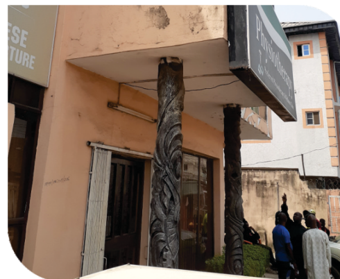
View from ground level: Entrance

The building consists of two sections, joined together by a central staircase to all sections of the property. The front building, well maintained, consists of two floors. The ground floor measures of 9 m x 18 m, with a hall at the front 9 m x 6 m, and then a hallway behind with three rooms off it on each side. There is a staircase going up to the upper section. It will become the parish hall, bookstore, priest's office, kitchen, and has its own toilets.